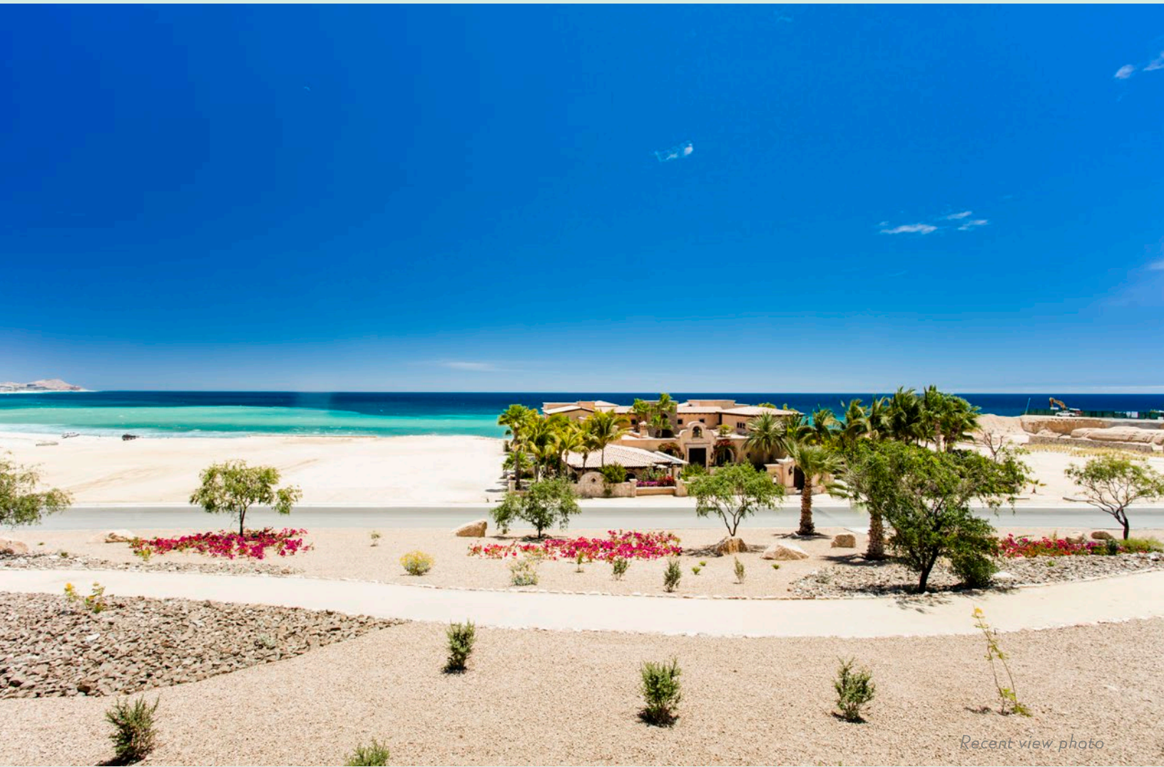
Recent view photo