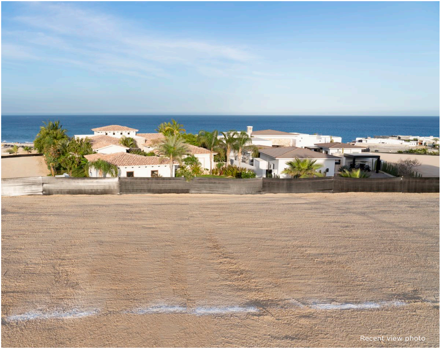
Recent view photo