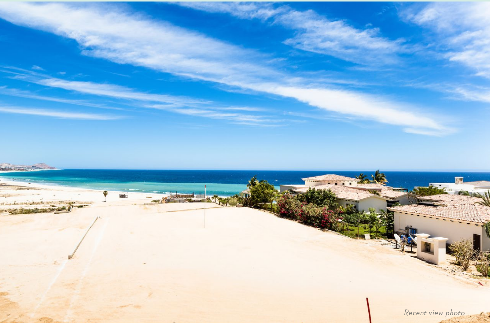
Recent view photo