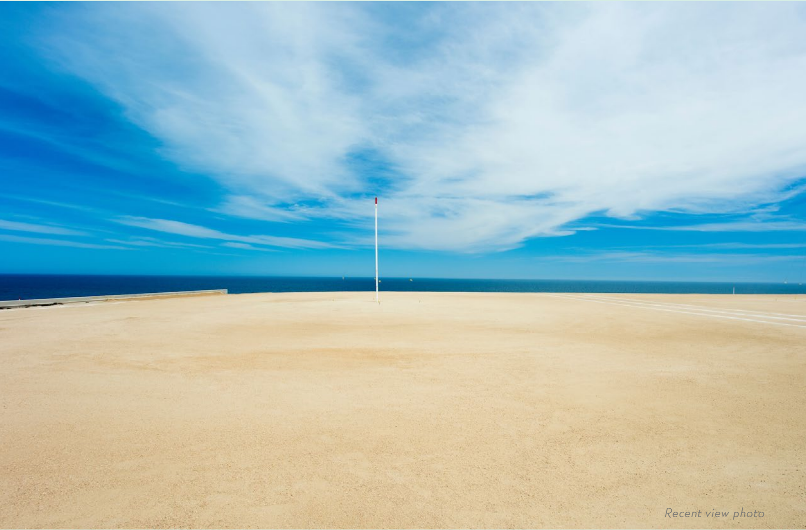
Recent view photo