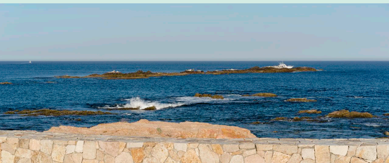
Recent view photo