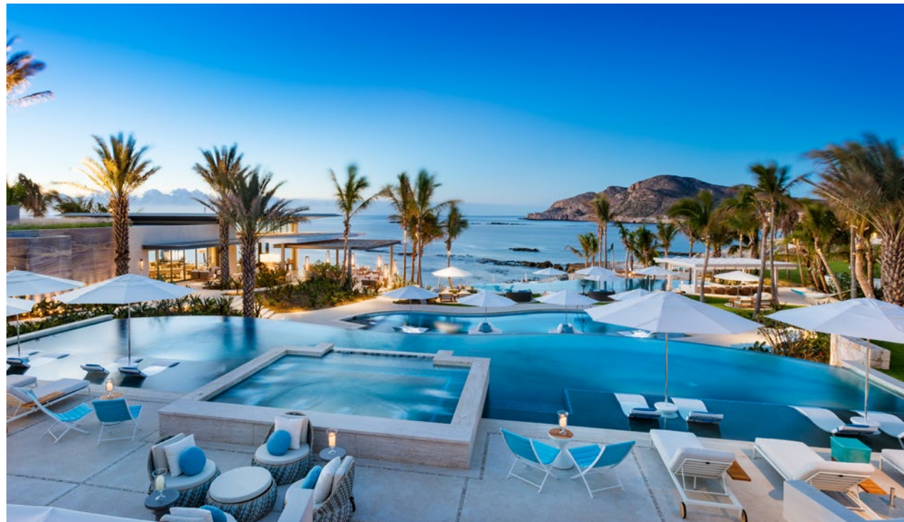
Photos Clockwise from Top Left: Chileno Bay OP Team, Beach Club Pool, Golf Course