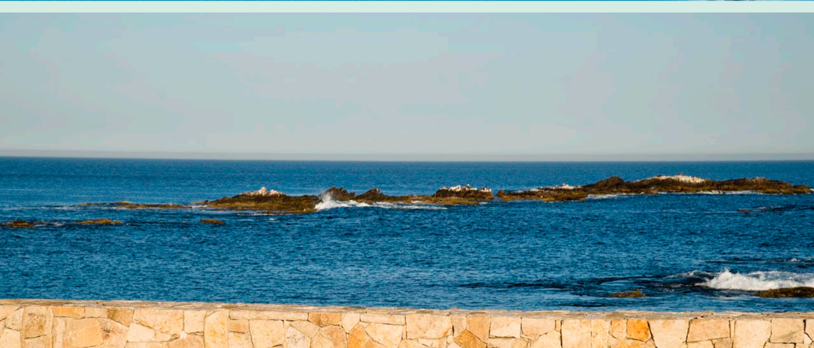
Recent view photo