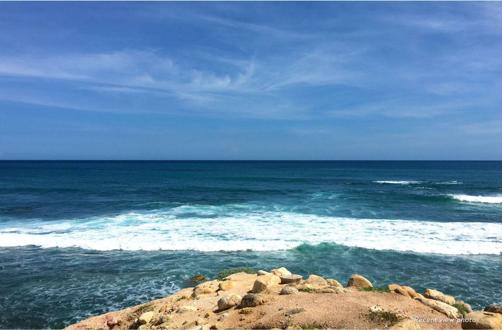
Recent view photo