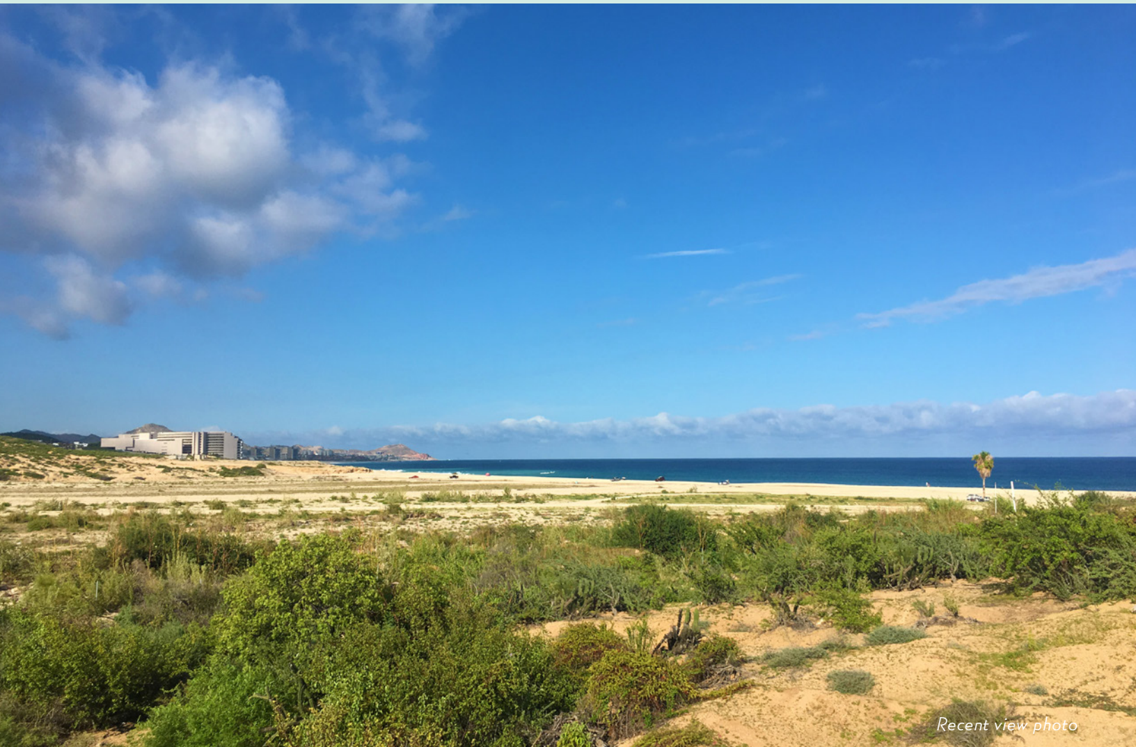
Recent view photo