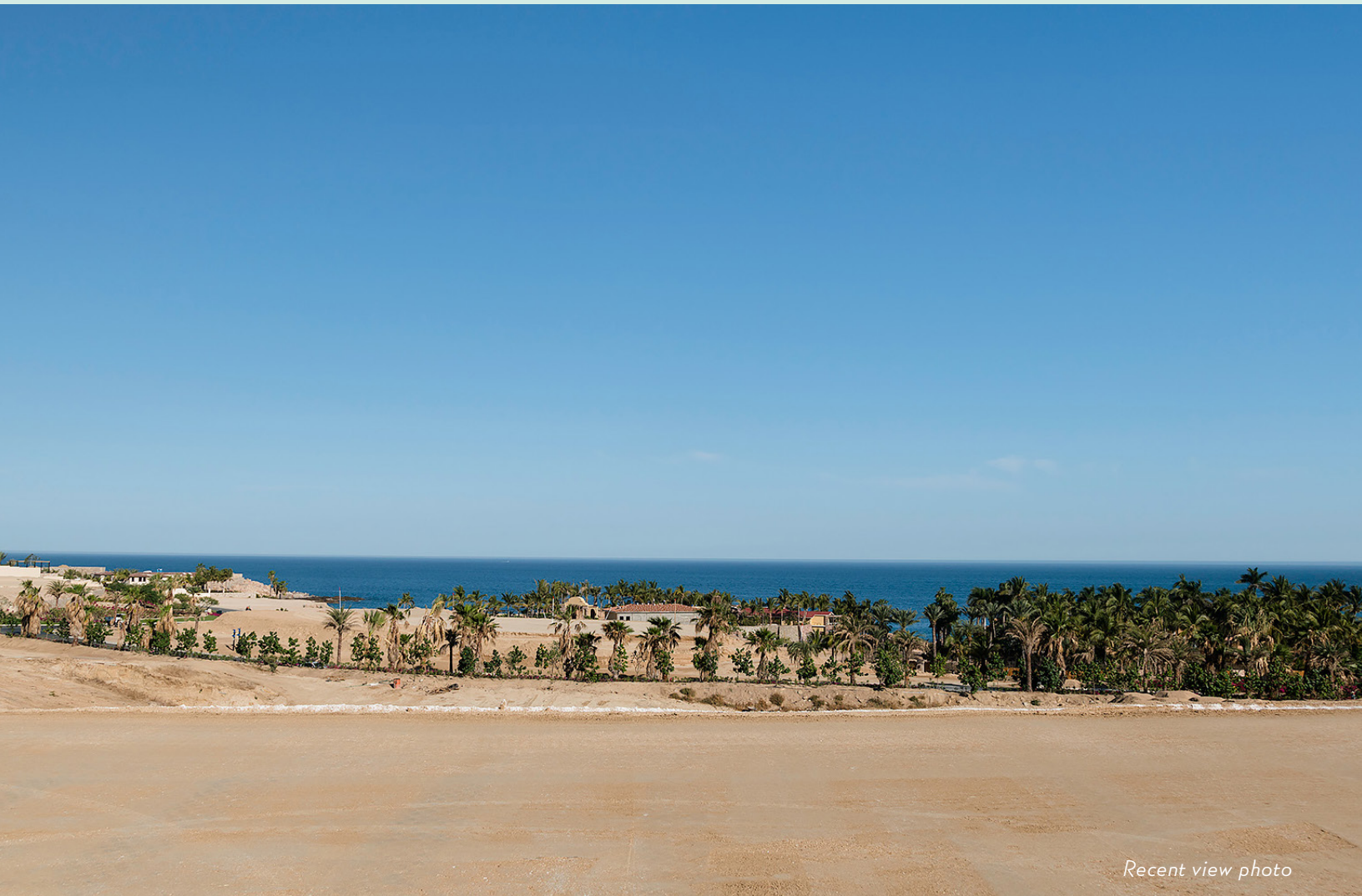
Recent view photo