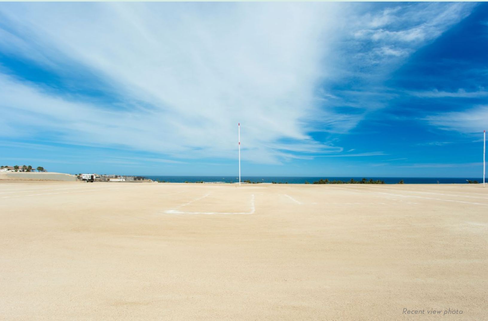
Recent view photo