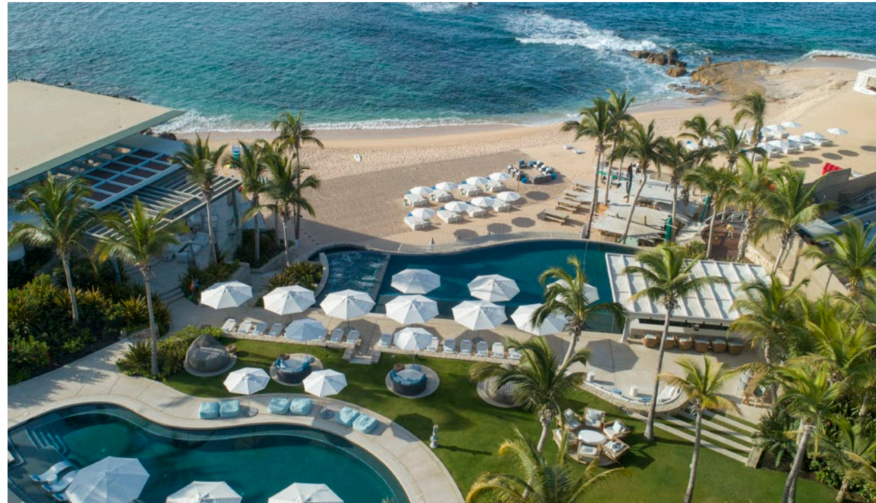
Photos Clockwise from Top Left: Chileno Bay OP Team, Beach Club Pool, Golf Course