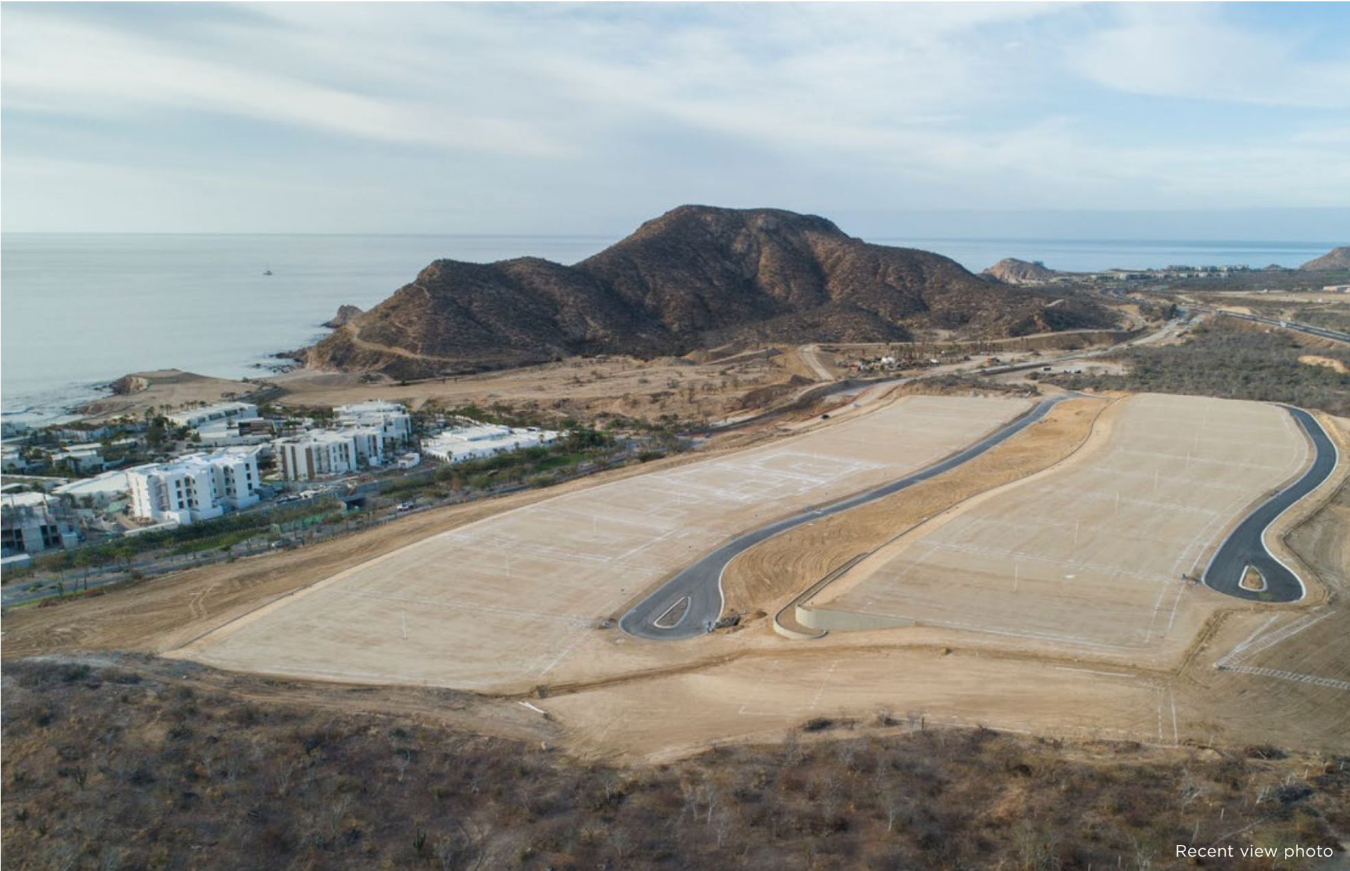
Recent view photo