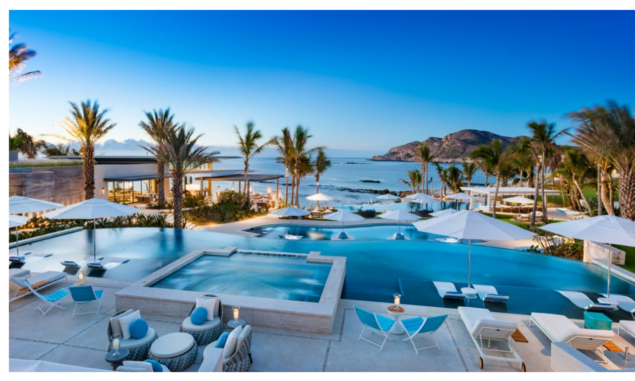
Photos Clockwise from Top Left: Chileno Bay OP Team, Beach Club Pool, Golf Course