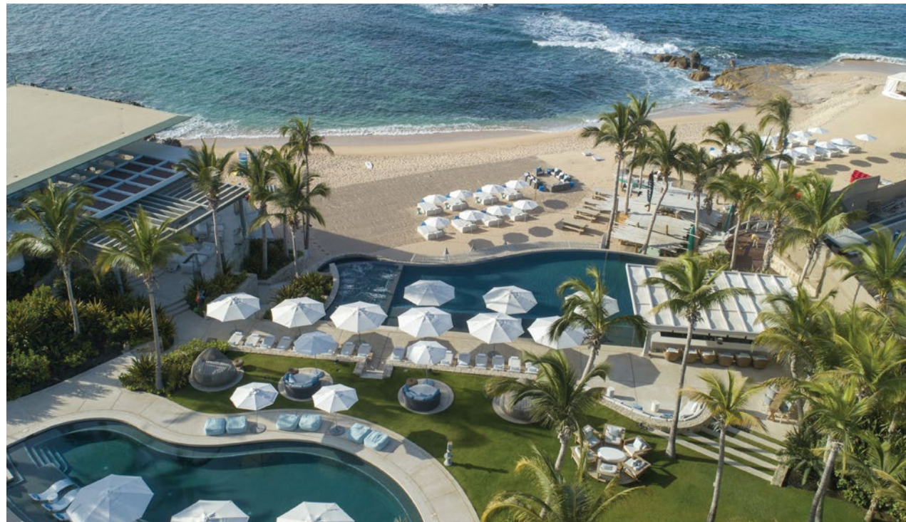
Photos Clockwise from Top Left: Chileno Bay OP Team, Beach Club Pool, Golf Course