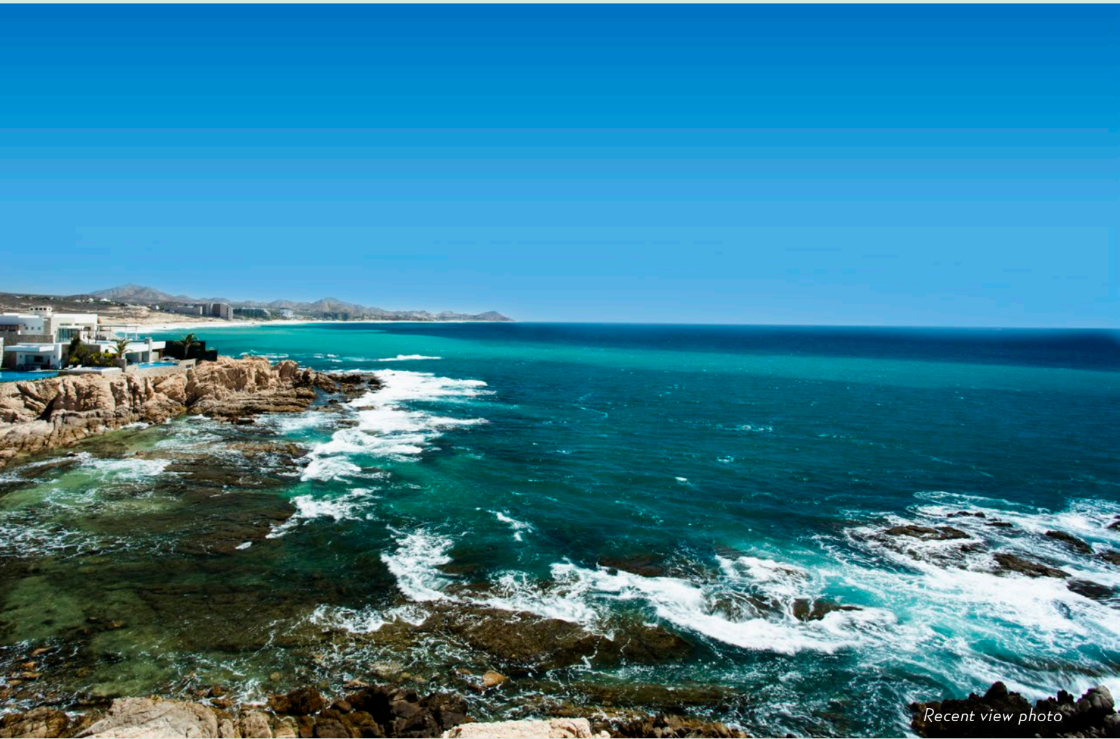
Recent view photo