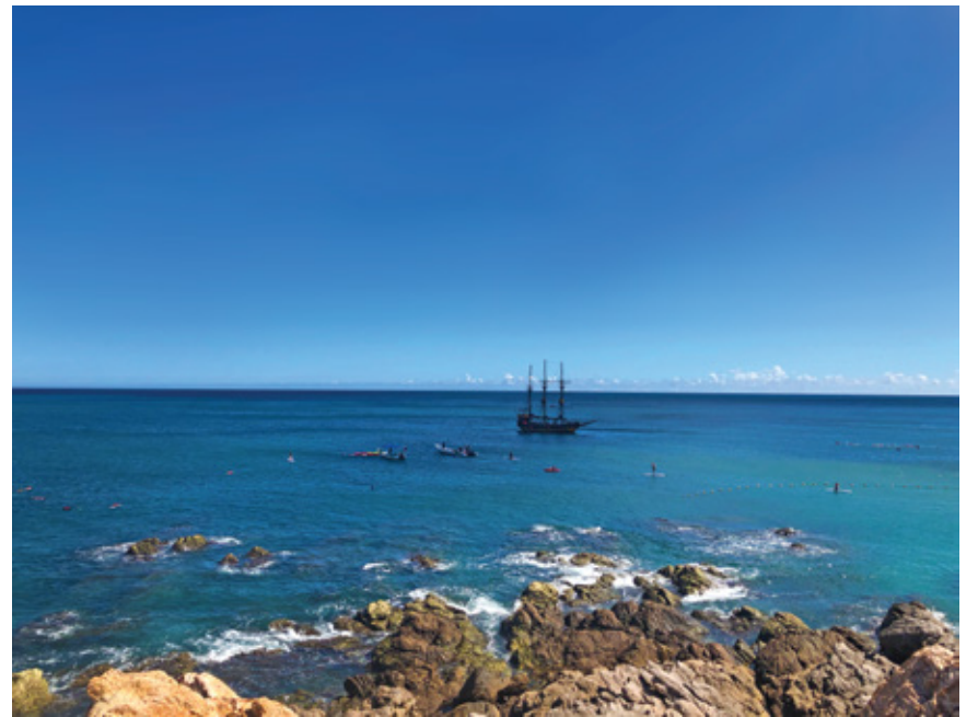
Recent views from lots