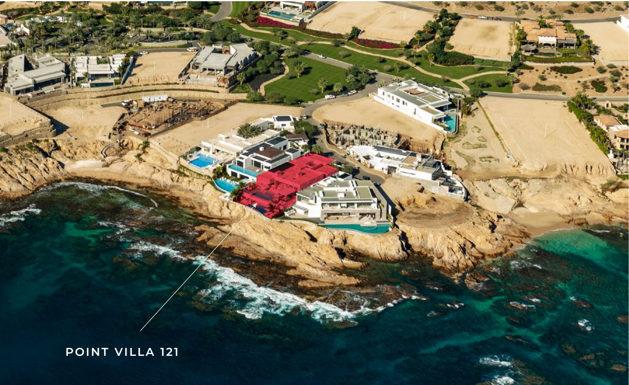
POINT VILLA 121