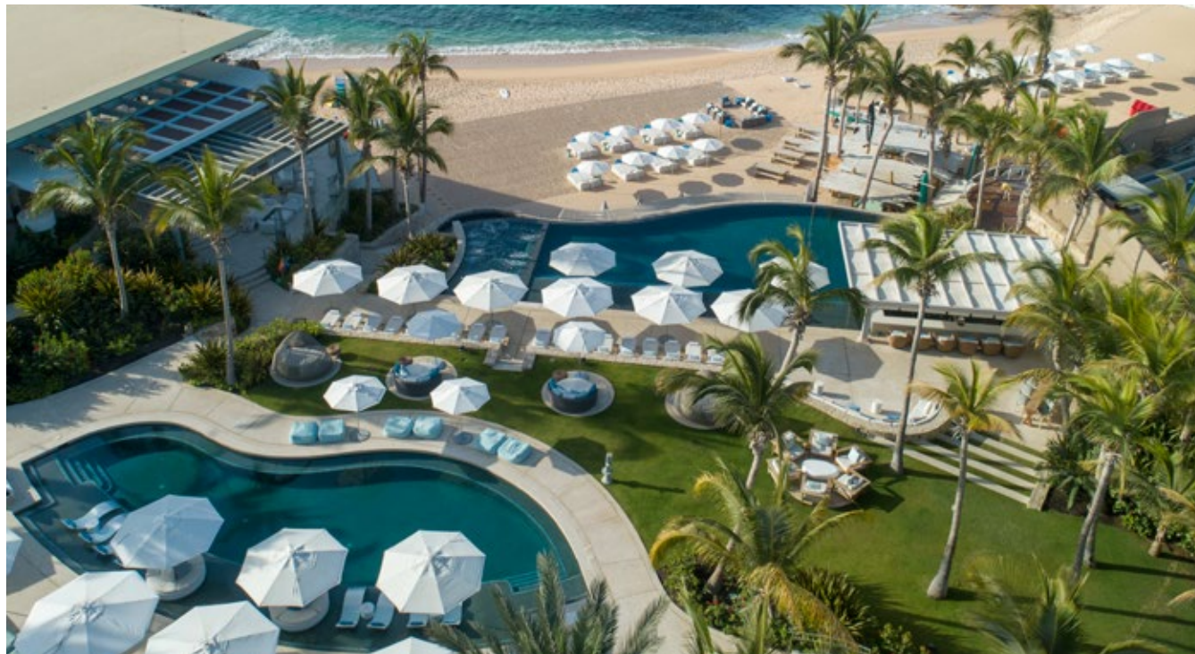
Photos Clockwise from Top Left: Chileno Bay OP Team, Beach Club Pool, Golf Course