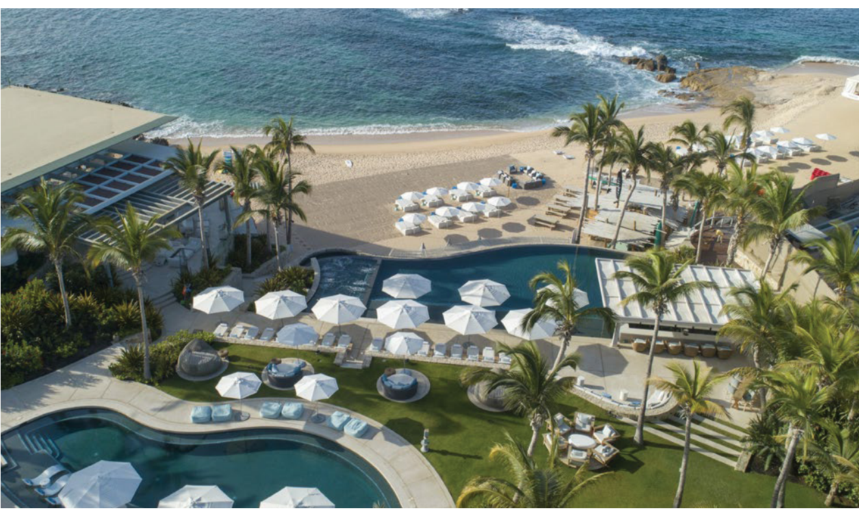
Photos Clockwise from Top Left: Chileno Bay OP Team, Beach Club Pool, Golf Course