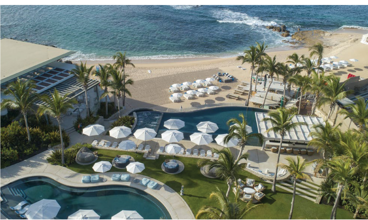
Photos Clockwise from Top Left: Chileno Bay OP Team, Beach Club Pool, Golf Course